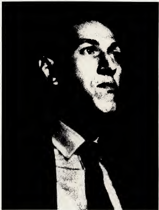
H.P.L. addressing THE KALEM CLUB